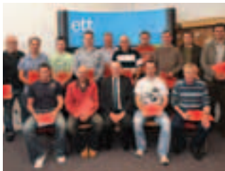
17th Edition Wiring Regulations training with ETT