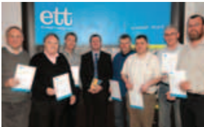
Site Safety Gold Card Participants gain success at ETT