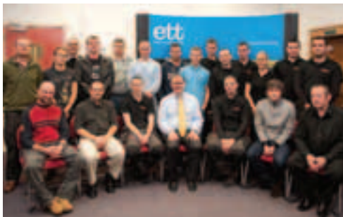
CSR Course Participants