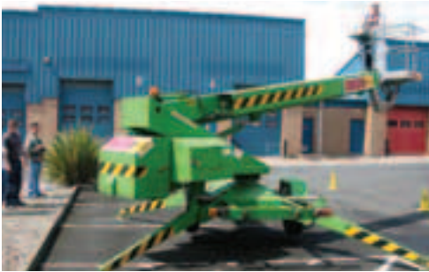
Learn how to do it safely and correctly with ETT